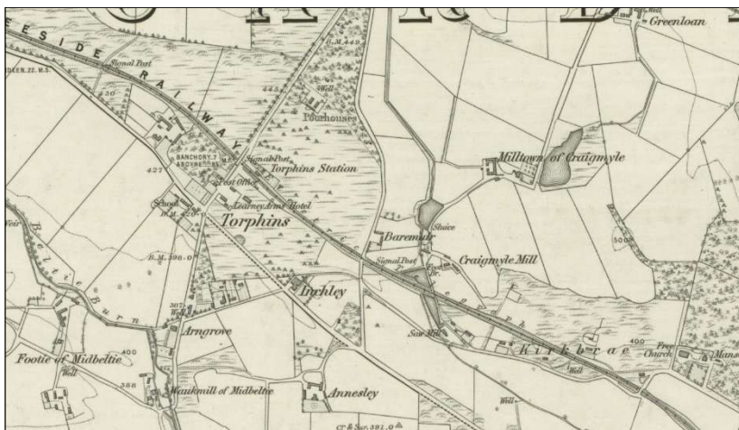
Map of Torphins from 1866.